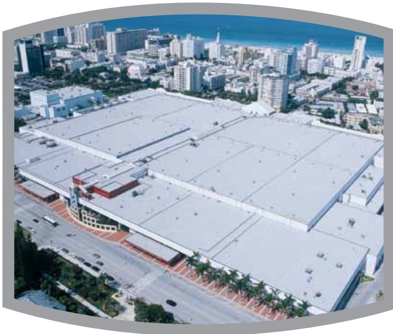
Miami Beach Convention Center and Jackie Gleason Theater of the Performing Arts— 873,000 square feet of Firestone 2-ply SBS system.